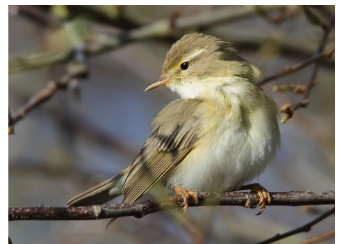
Willow Warbler