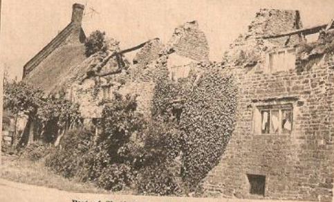
Part of Shutford, showing derelict Cottages.

THREE MEN were taken into custody by the police on Thursday night.