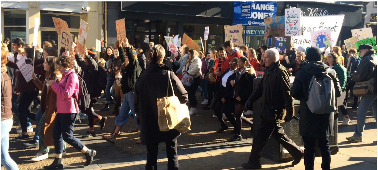
Students on the march in Oxford

It might be that the force required to make change happen can be generated by our children. On August 20th 2018 a 15 year old Swedish school girl went on strike from school and sat outside the Swedish Parliament with a few homemade flyers and a painted sign saying 'school strike for climate'. She continued her strike every day until Sweden's general election on September 9th, demanding that the Swedish government reduce carbon emissions in accordance with the Paris Climate Agreement. Since then she has continued to strike, every Friday, gaining worldwide media attention and inspiring a global network of student School Strikes - using the social media tag #FridaysForFuture.