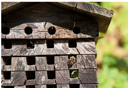
Leafcutter Bee making a nest