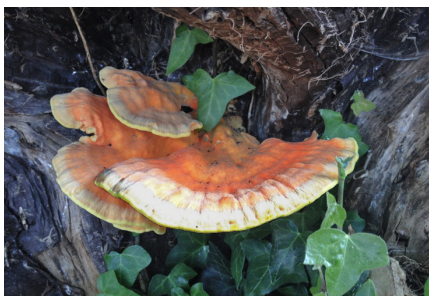
Chicken in the Woods fungus