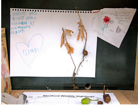
Hazel Seedlings by Isla and Poppy by Harvey

There have been lots of amazing sightings of Shutford wildlife recorded in the Nature Hub. Over a 2 month period from the first week of July to the first week of September there were 62 recordings of the sights and sounds of around 46 different species.