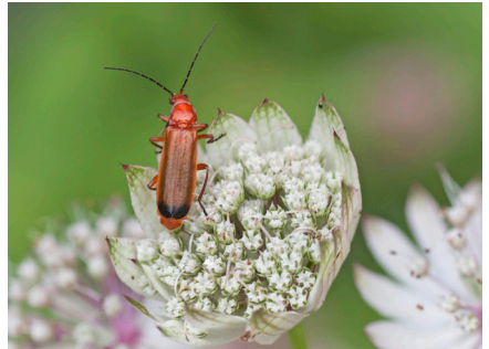
Common Red Soldier Beetle

Common Red Soldier Beetle on Astrantia flowers, Fat-legged Flower beetle on Betony flowers